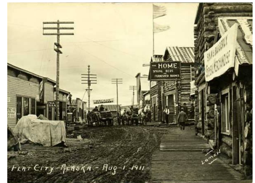
FLAT CITY, ALASKA - Aug 1, 1911