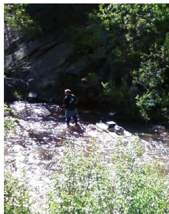
Lloyd Lauck at work