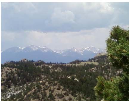
Collegiate Peaks from the Calumet Mine