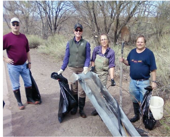
Trash, old sluice box, & homemade shovel.