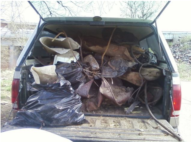
JJ/s truck completely full of trash.