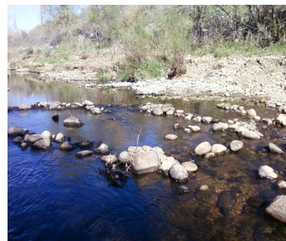
The Creek still has good water