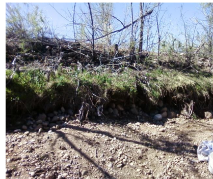
All these holes got filled