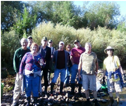
2012 Fall Beginners Class