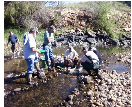
Learning how to sluice