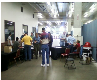
Our members helped the GPAA in many different ways

GPAA officials told us that they may well be back as soon as 2014 for the next big show.