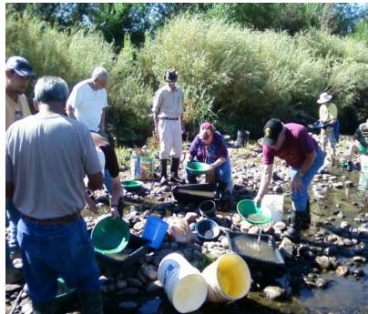
Practicing panning under the watchful eyes of instructors