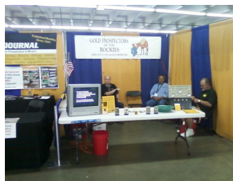
The GPR booth