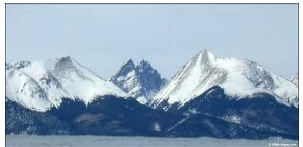
From L to R, Marble Mountain, Crestone Peak, Crestone Needle, Humboldt Peak