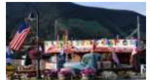
Lewis' Sweet Shop in Empire

EMPIRE: (Valley City, Union City) Early prospectors in the Central City area traveled by there over old Union Pass in the early 1860's. It wasn't until 1864 that they paused long enough to find some ore. But prior to that time, Empire had been the important stop on the pass. A hotel, blacksmith shop and combination grocery and post office were constructed. With the discovery of gold, several more cabins and buildings were built.