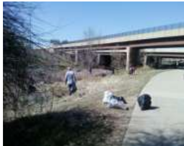
Picking up and bagging trash