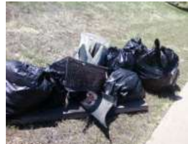
There were over 20 niles like this one