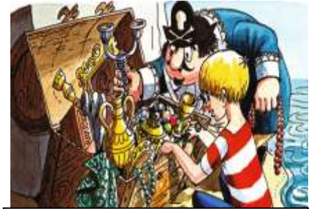
Nice find Captain, now, where is my cut?

(Reprinted from the March 23, 2013 International Print Edition of Metal Detecting Hobby Talk, a web based Detectorist Newsletter)