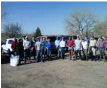
Getting ready to go

I want to offer my personal appreciation for everyone who participated in this event. Once again, our Club led the way with the best turnout, the best effort, and the best all-around show. I even managed to take a few pictures this time.