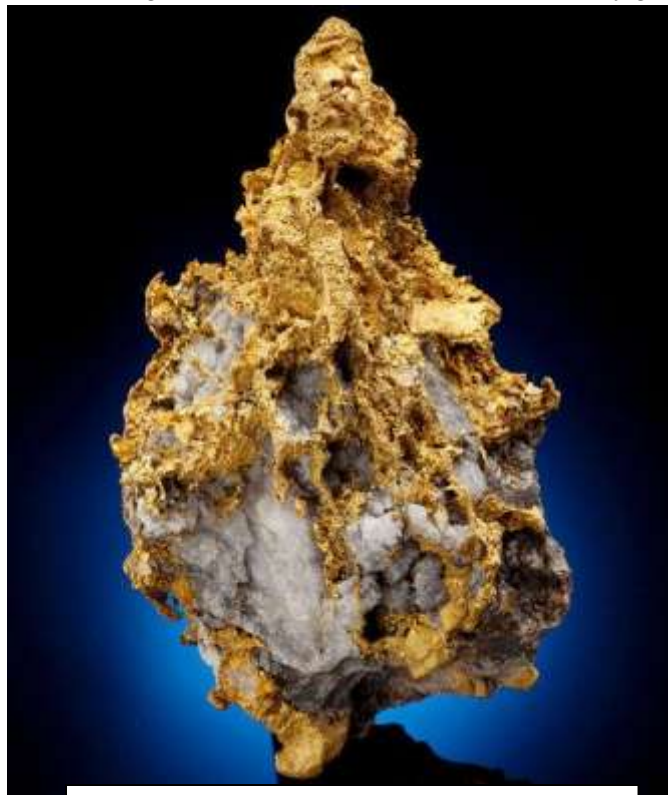
The tyrannosaur of the minerals, this gold nugget in quartz weighs more than 70 ounces (2 kilograms).

In their quest for gold, humans have pulled more than 188,000 tons (171,000 metric tons) of the metal from the ground, exhausting easily accessed sources, according to the World Gold Council, an industry group.