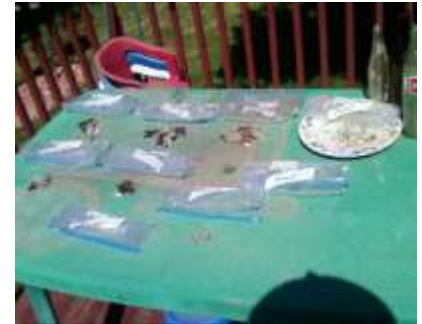
Everybody's submitted glass