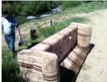
A couch was dragged out of the Creek