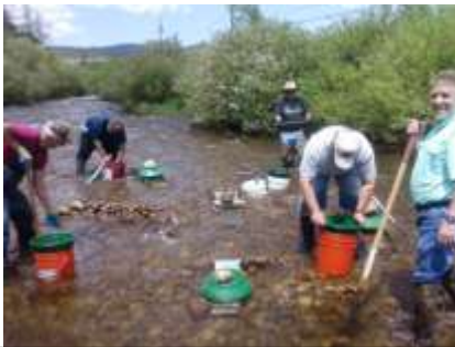
Working the gravel bar in Nederland

It is a privilege that the City of Nederland allows us to prospect in the Creek and we certainly appreciate it. I also managed to get a couple of photos during the fun and frolic.