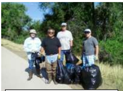
Some of the guys and some trash