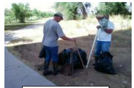
This is hard work!