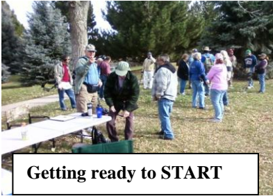
Getting ready to START