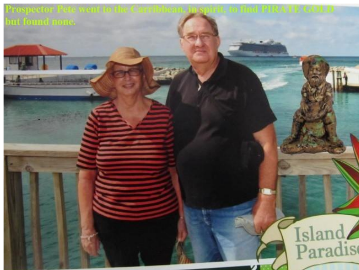
Prospector Pete went to the Caribbean, in spirit, to find PIRATE GOLD but found none.

Where Was Prospector Pete in Nov. While you were FREEZING, he was, in spirit only, on a cruise in the Caribbean looking for pirate treasure. Finding NONE he came back with us to Colorado to find some real gold. Cleaning up the summers concentrates in my garage with the grandkids.