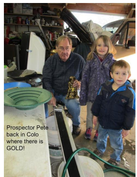
Prospector Pete back in Colo where there is GOLD!