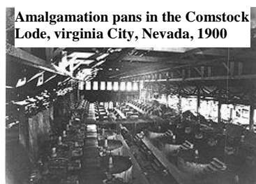
Amalgamation pans in the Comstock Lode, Virginia City, Nevada, 1900

required that ore be crushed and refiners quickly established mills to process ore once amalgamation was introduced. By the seventeenth century, water-powered mills became dominant in both New Spain and Peru. Due to amalgamation's reliance upon mercury, an expansion of mercury production was central to the expansion of silver production. From shortly after the invention of mercury amalgamation to the end of the colonial period, the Spanish crown maintained a monopoly on mercury production and distribution, ensuring a steady supply of royal income. Fluctuations in mercury prices generally resulted in corresponding increases and decreases in silver production.