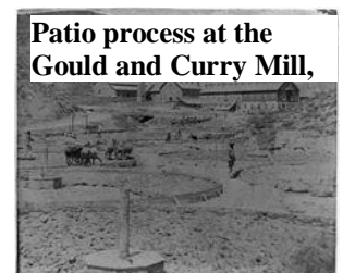
Patio process at the Gould and Curry Mill,

Silver ores were crushed (typically either in "arrastras" or stamp mills to a fine slime which was mixed with salt, water, magistral (essentially an impure form of copper sulfate, and mercury, and spread in a 1-to-2-foot-thick (0.30 to 0.61 m) layer in a patio, (a shallow-walled, open enclosure). Horses were driven around on the patio to further mix the ingredients. After weeks of mixing and soaking in the sun, a complex reaction converted the silver to native metal, which formed an amalgam with the mercury and was recovered. The amount of salt and copper sulfate varied from one-quarter to ten pounds of one or the other, or both, per ton of ore treated. The decision of how much of each ingredient to add, how much mixing was needed, and when to halt the process depended on the skill of an azoguero (English: quicksilver man). The loss of mercury in amalgamation processes is generally one to two times the weight of silver recovered. The patio process was the first form of amalgamation. However, it is unclear whether this process or a similar process—in which amalgamation occurred in heated vats rather than open patios—was the predominant form of amalgamation in New Spain, as the earliest known illustration of the patio process dates from 1761. There is substantial evidence that both processes were used from an early date in New Spain, while open patios were never adopted in Peru. Both processes