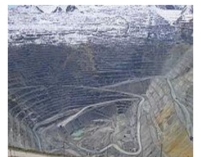
The Bingham Canyon Mine, Kennecott Utah Copper

Mining industry: Mining exists in many countries. London is known as the capital of global "mining houses" such as the Rio Tinto Group, BHP Billiton, and Anglo American PLC. The US mining industry is also large, but it is dominated by the coal and other nonmetal minerals (e.g., rock and sand), and various regulations have worked to reduce the significance of mining in the United States. In 2007 the total market capitalization of mining companies was reported at US$962 billion, which compares to a total global market cap of publicly traded companies of about US$50 trillion in 2007. In 2002, Chile and Peru were reportedly the major mining