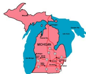
This is a royalty free image that can be used for your personal, corporate or education projects. It can not be resold or freely distributed. If you need an editable PowerPoint or Adobe Illustrator version of this map please visit www.mapsofindia.com or www.mapofindia.com. This text can be cropped off.