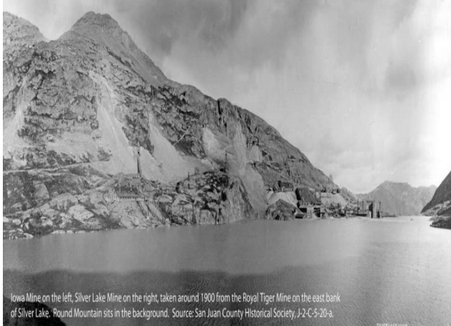
Iowa Mine on the left, Silver Lake Mine on the right, taken around 1900 from the Royal Tiger Mine on the east bank of Silver Lake. Round Mountain sits in the background.

But then another national recession struck. The company closed its new facility in 1908 and leased out blocks of ground at the Silver Lake to small parties instead of working the mine itself. Over the next few years, a number of natural calamities took a toll. In 1909 the Silver Lake tramway's turning station burned again and wrecked the system. Then in 1911 a series of avalanches took out towers on both the Silver Lake and Iowa tramways and started a fire at a transformer station. In 1912 another blaze that started at the Silver Lake's blacksmith shop destroyed the upper tramway terminal in addition to virtually all the property's buildings, except one of the boarding houses. As a result, the corporation gave up large-scale production but continued to farm out blocks of ground to small groups. Ironically, in contrast to Edward and Lena Stoiber, ASARCO never earned a profit from the Silver Lake, although the company employed competent engineers. Meanwhile, during the early 1900s the Iowa Gold Mining & Milling Company, second- largest outfit in the Las Animas